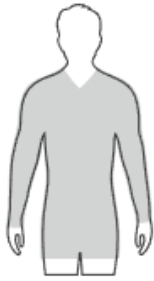
TAILORED / SLIM FIT

Tapered through the chest, shoulders and waist for a slim fit.